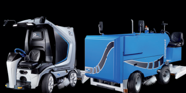
Mobile / Event

Outdooricerinks.com Strongsville (OH) Phone 1-440-628-7979 www.outdooricerinks.com