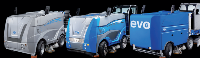
Pro / Heavy duty