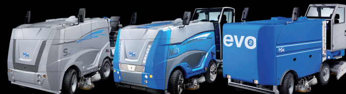
Pro / Heavy duty