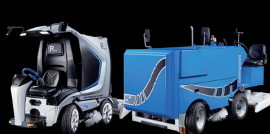
Mobile / Event

Outdooricerinks.com Strongsville (OH) Phone 1-440-628-7979 www.outdooricerinks.com