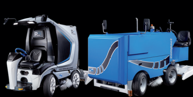
Mobile / Event

Outdooricerinks.com Strongsville (OH) Phone 1-440-628-7979 www.outdooricerinks.com