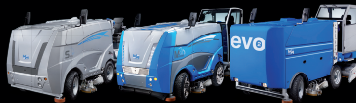
Pro / Heavy duty