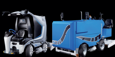
Mobile / Event