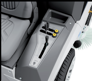
Hydraulic blade adjustment