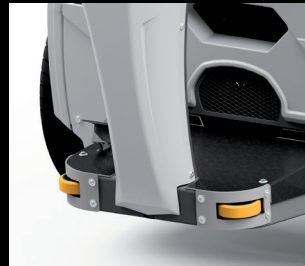
Protective guard for board guide rollers