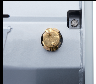
Screw conveyor wash system horizontal