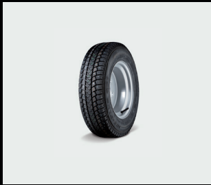
Spare wheel 12"