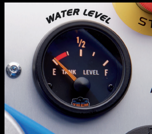
Water tank signage