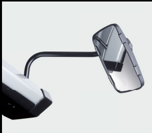
Side mirrors front left & right