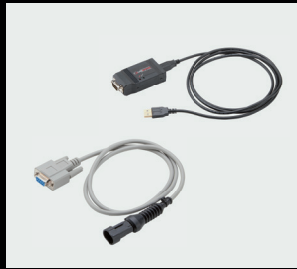
Diagnostic cable BMS