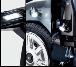
Front and working lights