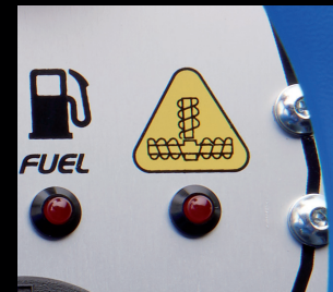
Conveyor screw overload warning system