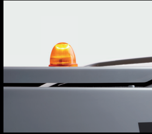
Flashing warning light