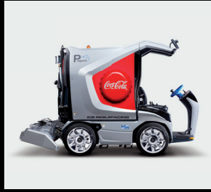
Custom wrap 4c digital print