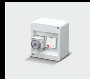
Acquastop valve with time relay