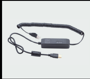
Diagnostic cable Controller