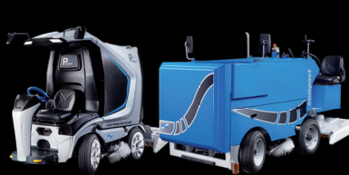
Mobile / Event

Outdooricerinks.com Strongsville (OH) Phone 1-440-628-7979 www.outdooricerinks.com