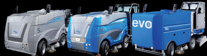
Pro / Heavy duty